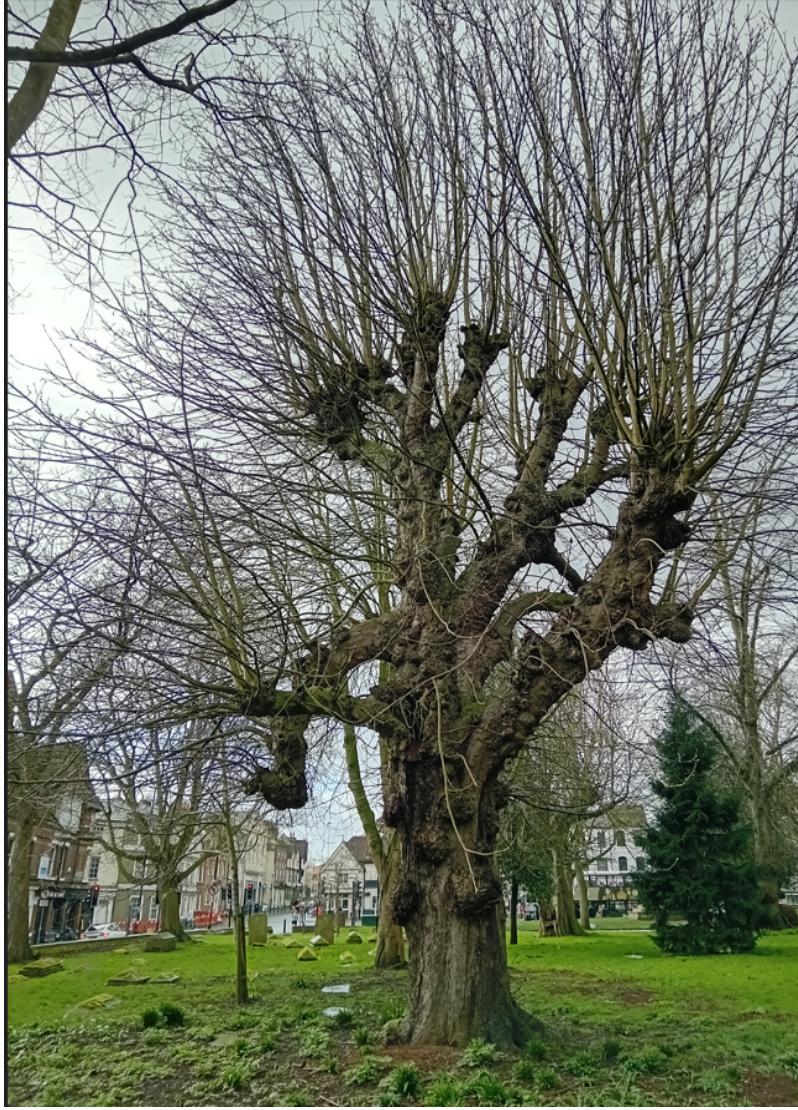
T11 Horse Chestnut