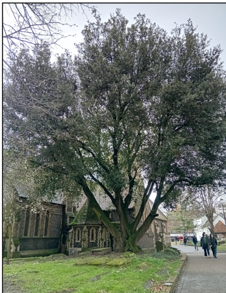
non-TPO Holm Oak (for information only)